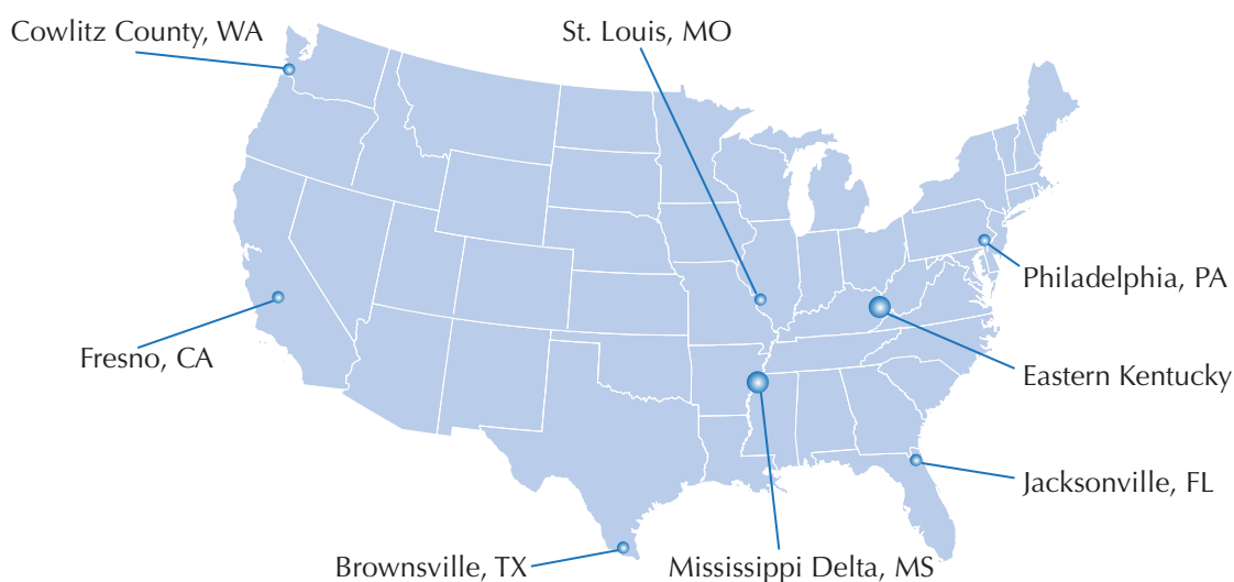
Figure 2 Selected Communities of the CFAP

Larger circles indicate regional pilots.